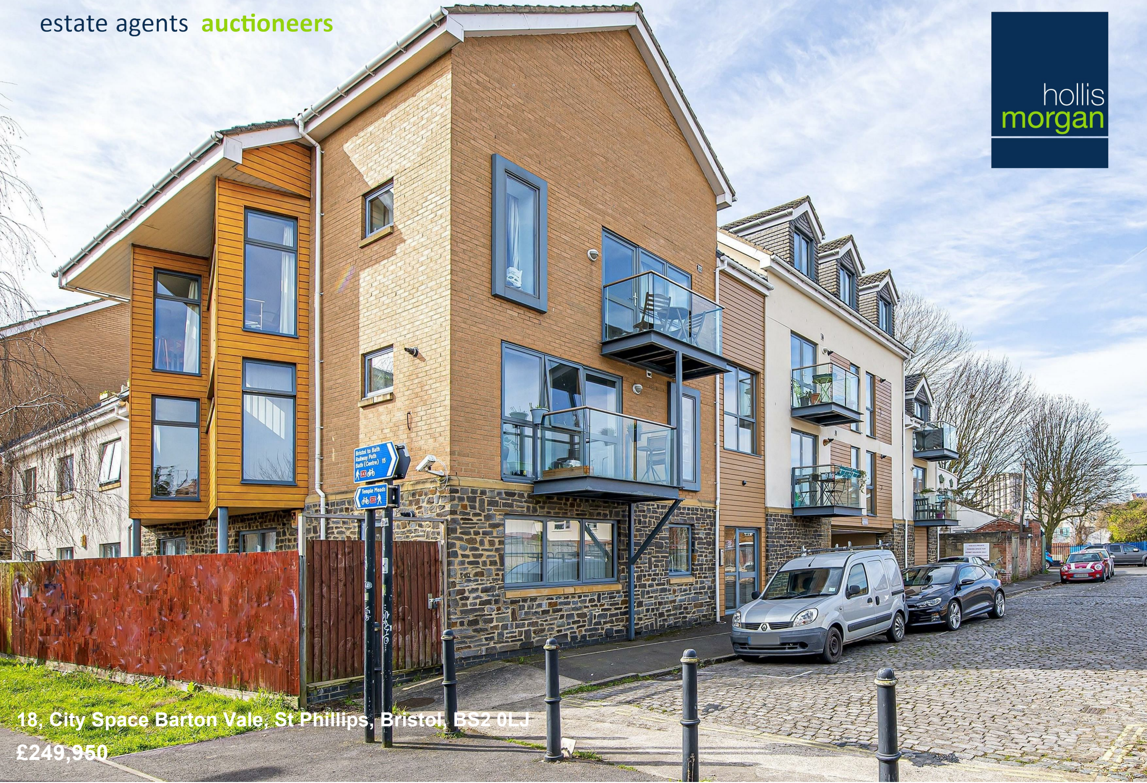
18, City Space Barton Vale, St Phillips, Bristol, BS2 0LJ